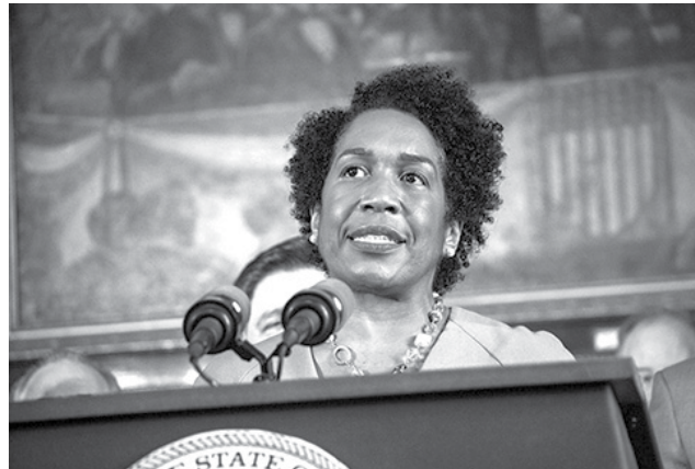
Lt. Gov. Juliana Stratton is pictured at a news conference in the governor’s office in 2023.