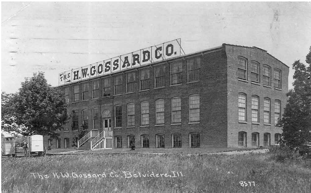
Turn of the Century H.W. Gossard Company building on Allen and Columbia in Belvidere

To be notified of new issues online, register at www.boonecountyjournal.com