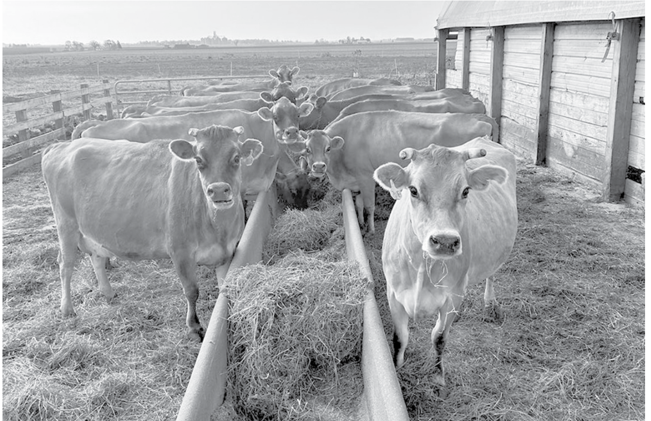
Cows on the Little Brown Cow Dairy farm in Delavan IL.

With the ascension of Robert F. Kennedy Jr. to U.S. Health and Human Services secretary and allies in the Make America Healthy Again movement, raw milk advocates have cheered on newfound support at the federal level. These developments, they hoped, could set the stage for more widespread sales of the controversial beverage.