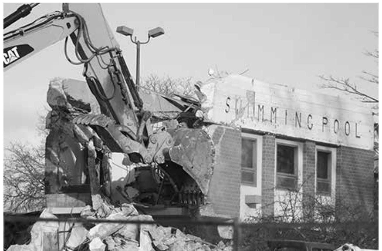
The final moments of the Belvidere Park Pool