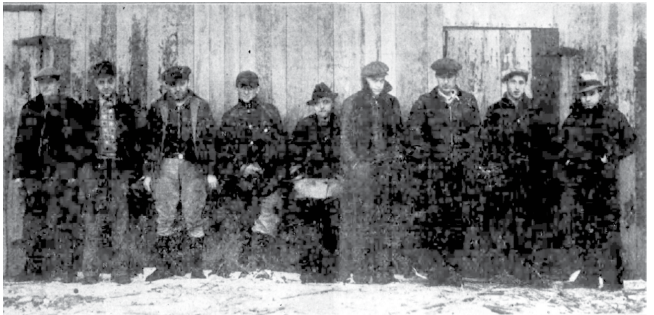
Bootleggers after the Boone County arrest, Giancana furthest right.