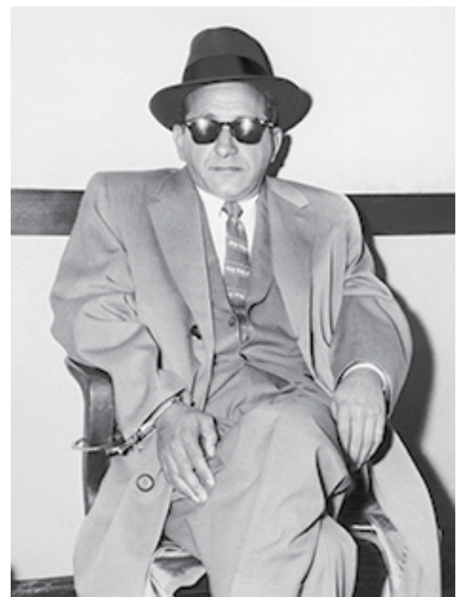
Sam "Momo" Giancana handcuffed to his chair