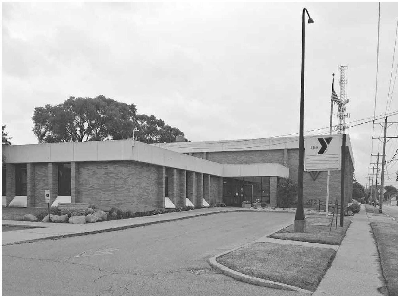
The Belvidere YMCA on Locust Street