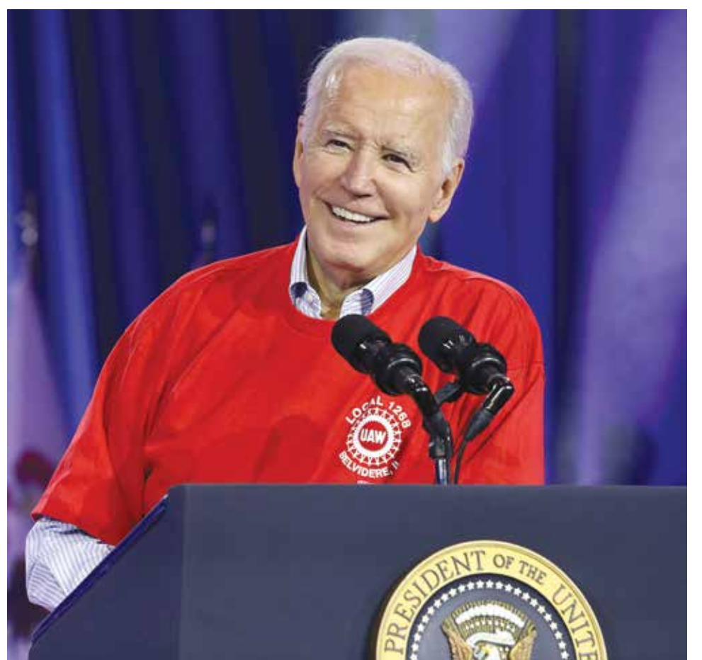
President Joe Biden when he visited Belvidere in November 2023. President Biden announced this past Sunday that he will not seek reelection to a second term.