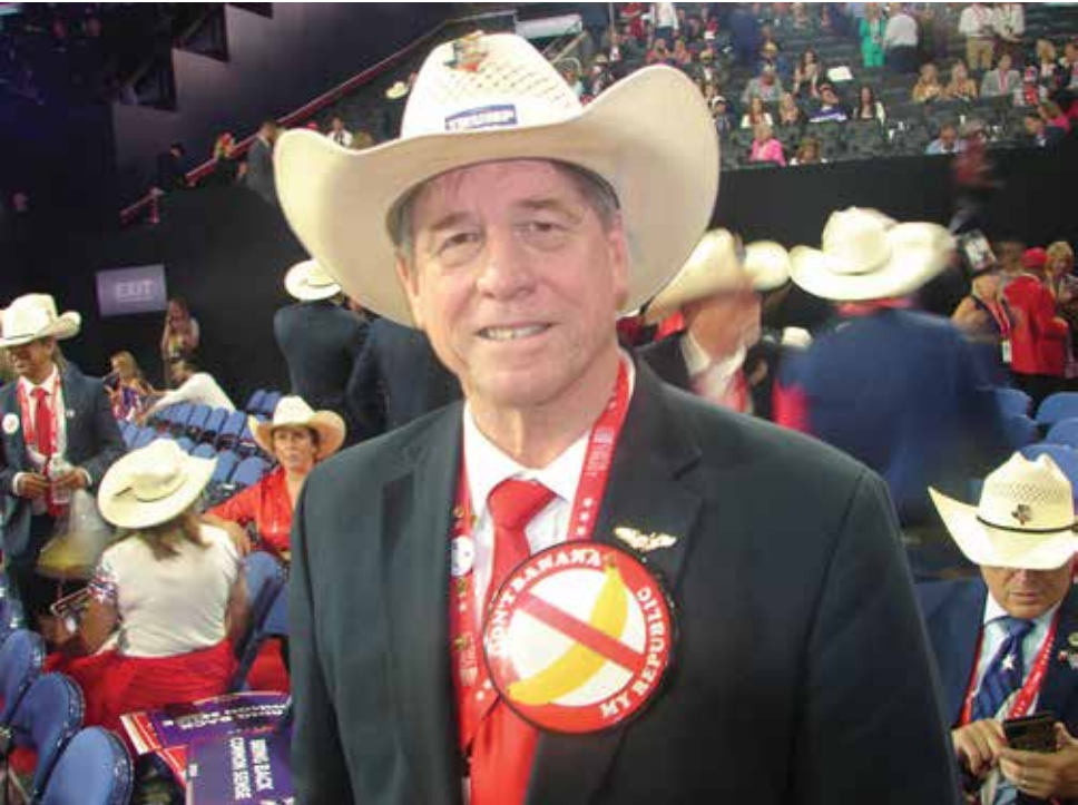
Texas Delegate with a story