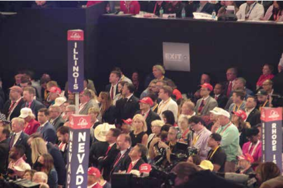
Illinois delegation on the convention floor in Milwaukee