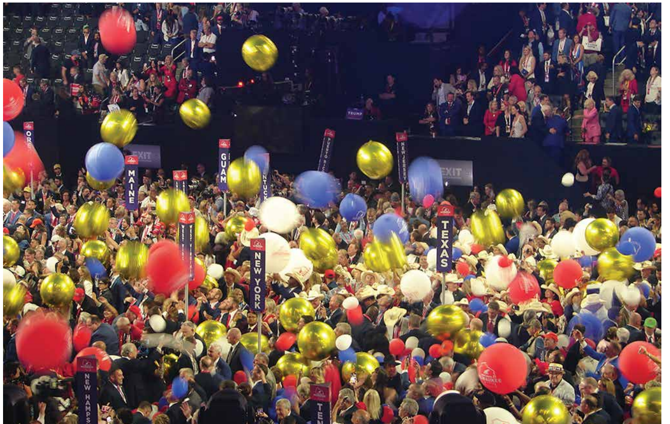
The signature balloon drop ending the Republican Convention in Milwaukee

There were local policemen from all over the United States, as well as Secret Service and Homeland Security officers. They were all very pleasant and polite to us, but none of them had the faintest idea