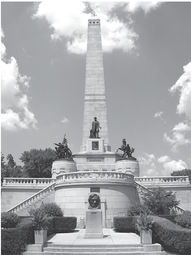
Abraham Lincoln Tomb, Oak Ridge Cemetery, Springfield

Capitol News Illinois is a nonprofit, nonpartisan news service that distributes state government coverage to hundreds of news outlets statewide. It is funded primarily by the Illinois Press Foundation and the Robert R. McCormick Foundation.