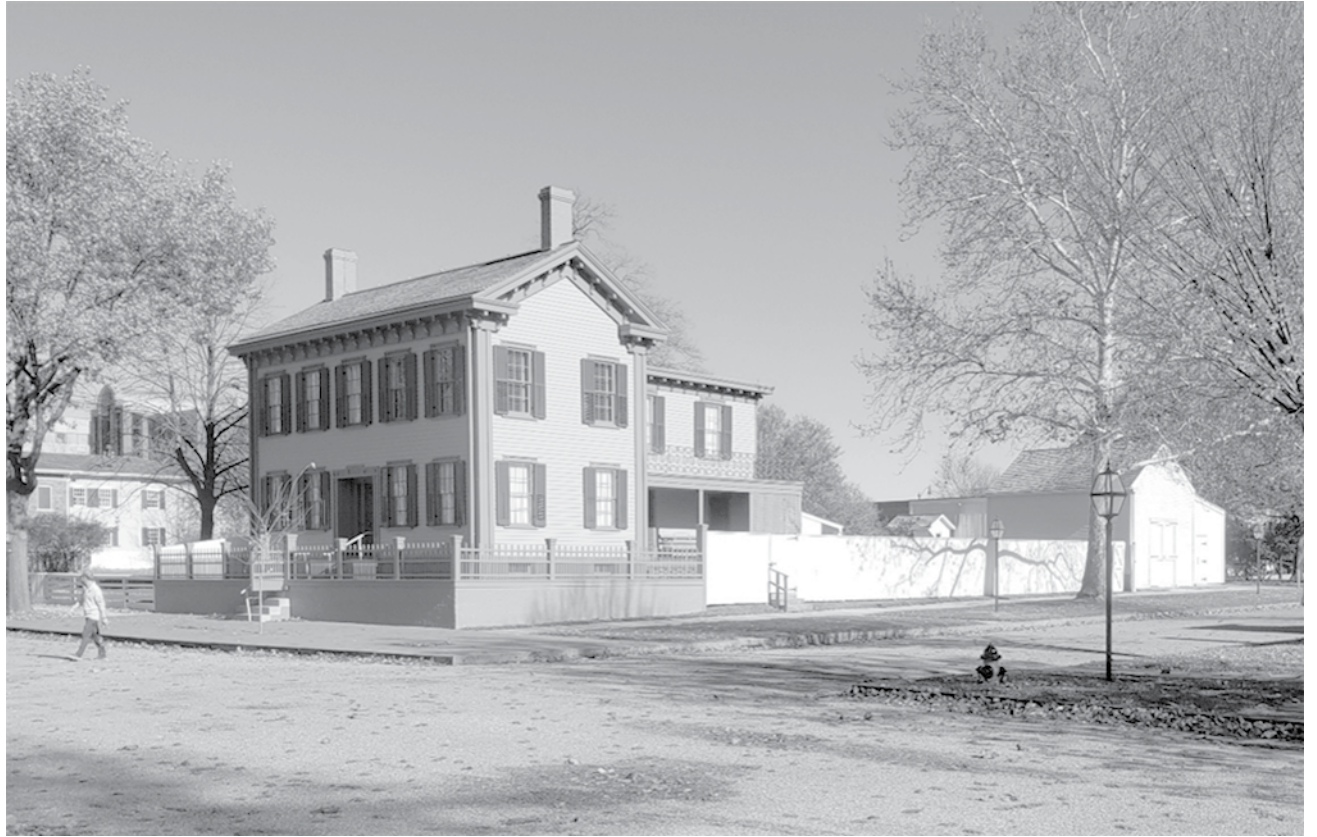
Abraham Lincoln's Home in Springfield