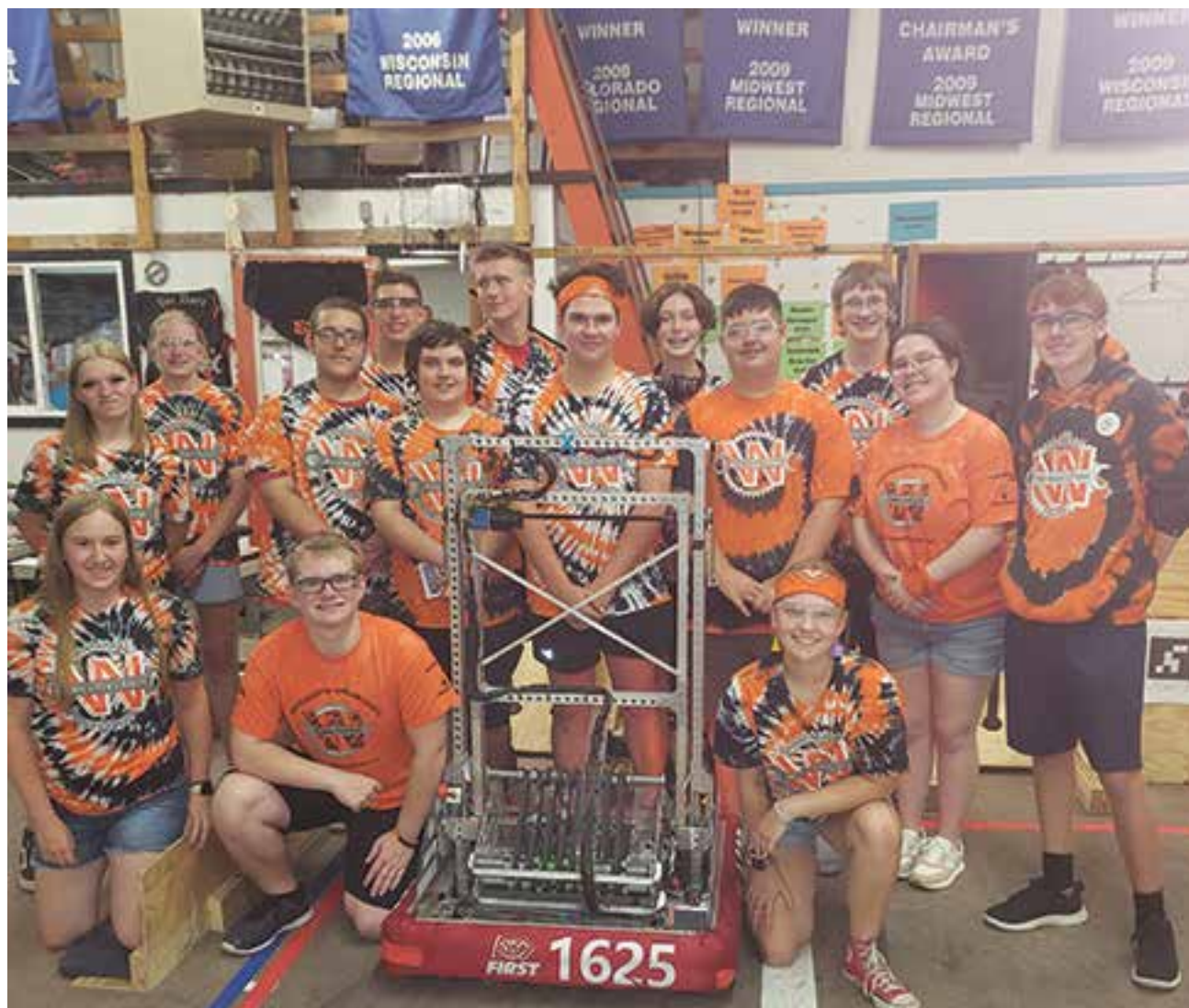
The Winnovation Robotics Team with their robot, “Panda.”

Canadian-based company specializes in medium and heavy-duty all-electric vehicles, including electric school buses.