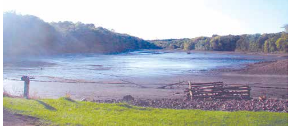
Lake Le-Aqua-Na drained