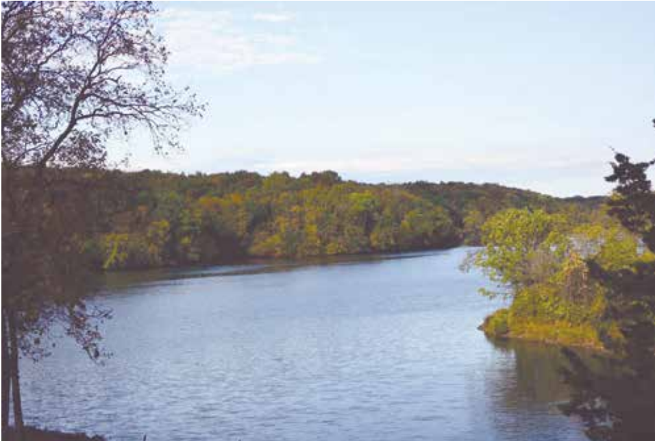
Lake Le-Aqua-Na