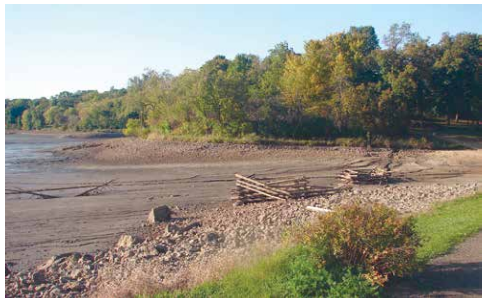
Fish habitats made of wood

Several other new facilities will be constructed. A relocated, sanitary dump station will be separate from the main entrance to the camping area. A new, handicapped-accessible fishing pier will be built. To alleviate the silt problem, several small ponds will be constructed in the park, upstream from the lake. These ponds will have weirs that will trap silt and other material, reducing the amount of debris that will reach the lake. A weir is a small, notched dam often used to catch fish, but used in this case to trap sediments in the water.