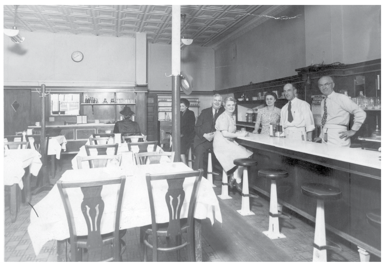
Dearth Brothers Restaurant in Belvidere

Sports award dinners were held at the restaurant. In 1946, when polio irradiation was in full swing, the local chapter to irradiate polio held a retirement party for its chairman. The list goes on and on because of the food and good spirit the brothers carried.