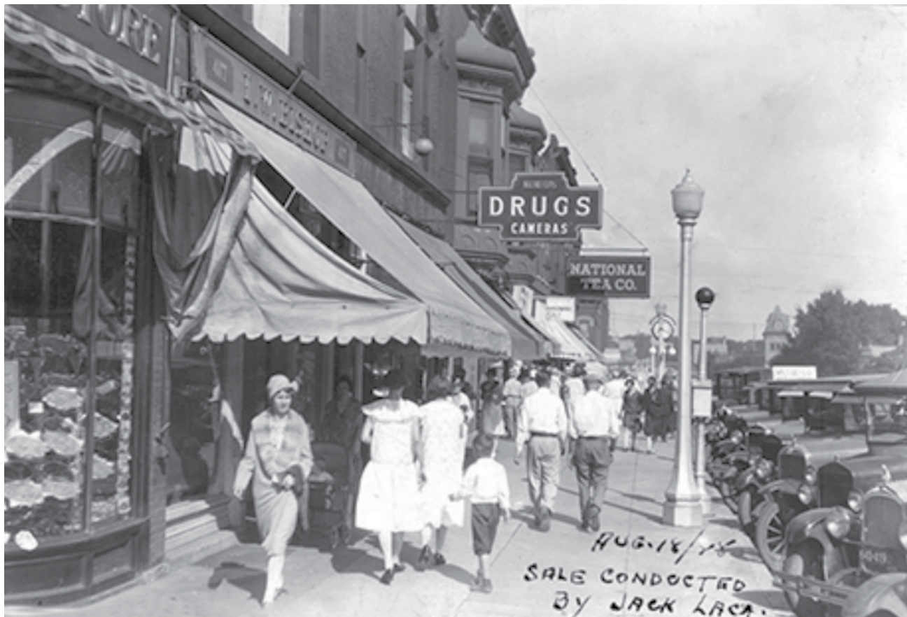
It's a Beautiful Day, "Hot Summer Day" August 18, 1918 downtown Belvidere

The worldwide epidemic in 1918 took the lives of 20 million people worldwide.