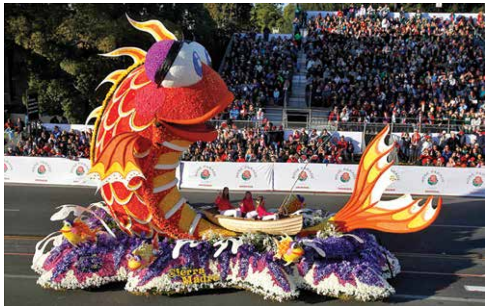
The Rose Parade, Pasadena