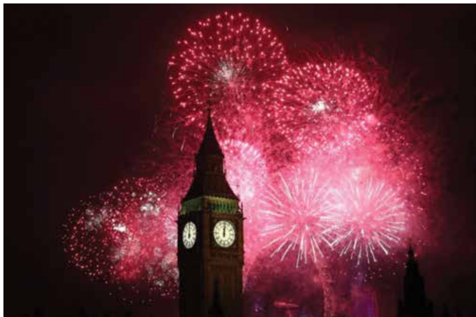
New Year's Fireworks, London