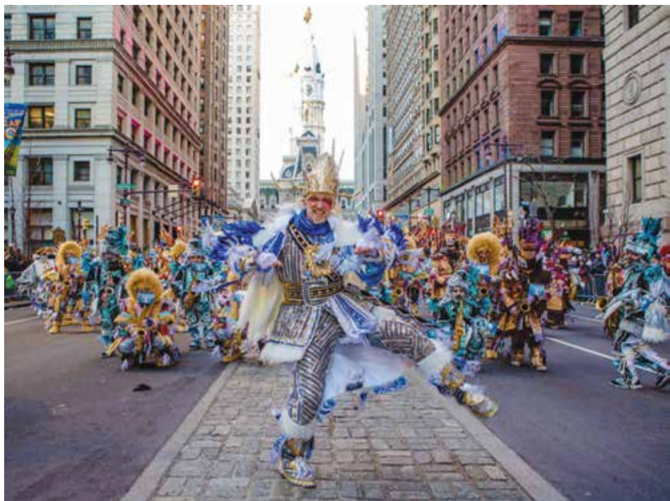
The Mummers Parade, Philadelphia